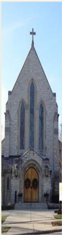
Outside of Christ Church Episcopal - Whitefish Bay